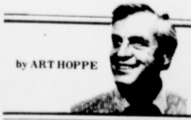
by ART HOPPE

If you're more goal-oriented, you might take a leaf out of George K.'s book. After only 18 months of retire-