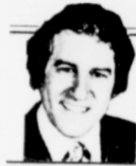
by Louis Rukeyser

The rock was the stock market. Some told us around New Year's that it was about to be flung high into heavens never previously explored by human beings or even stockbrokers. Others were equally certain that it was about to plunge