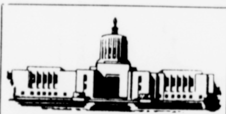
Legislative Report from the State Capital EXCLUSIVE to Oregon's Weekly Newspapers from Associated Oregon Industries.

Noteworthy was the fact boundaries were redrawn for both legislative and congressional districts. Although legislative reapportionment faces a court test in