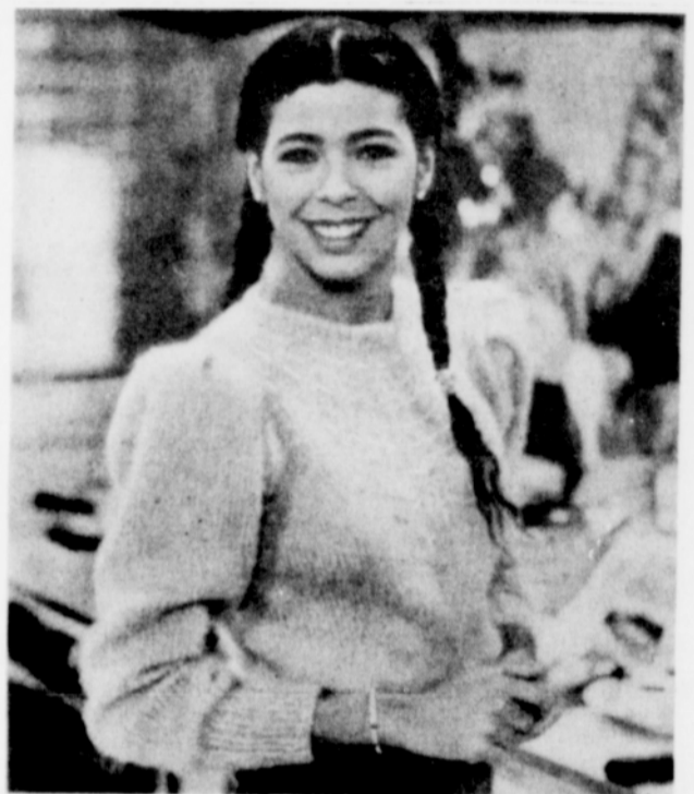
Irene Cara plays Irene Cannon, a dedicated young performer who moves from Nebraska to New York City to pursue a show-business career in "Irene," to air Wednesday, Aug. 19 on NBC.

7 [TMC] MOVIE: 'Badge 373' A suspended New York City detective tracks his