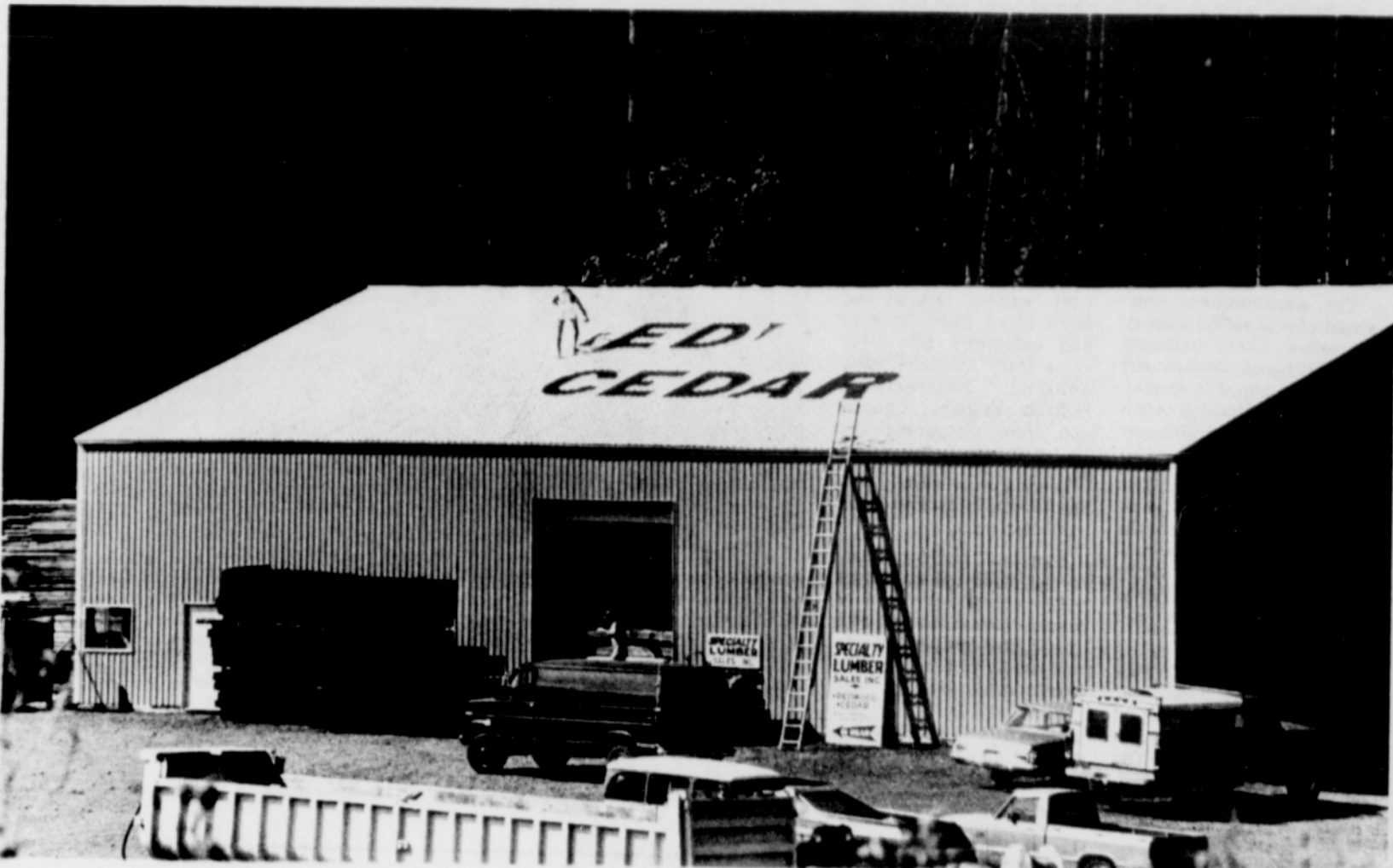
A workman at Specialty Lumber Sales, Inc., painted over the building's roof sign Tuesday. City ordinances don't allow such signs, however, city officials have worked with owners of Mt. Hood Industrial Park to provide a new sign

For more information about the small business breakfast seminars contact the MHCC Maywood Center, 667-3430.