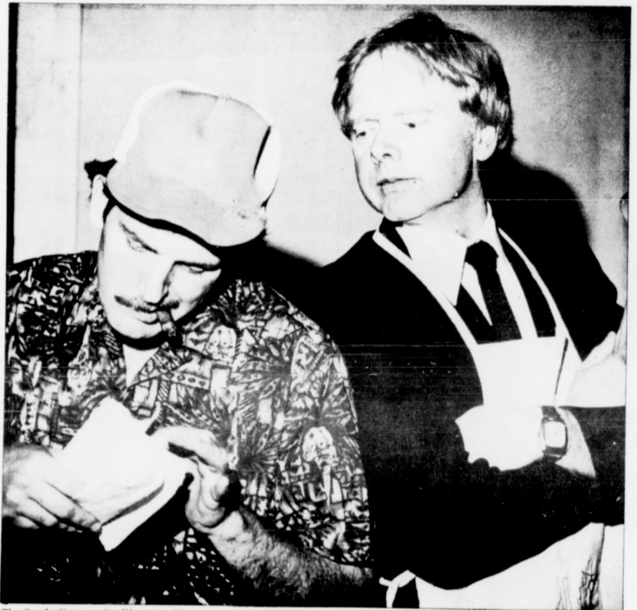
The Sandy Community Players will present the Neil Simon classic "The Odd Couple" July 10 and 11 at 8 p.m.

The Optimists have also raised money for the Talented and Gifted (TAG) program and many other programs for teens and children.