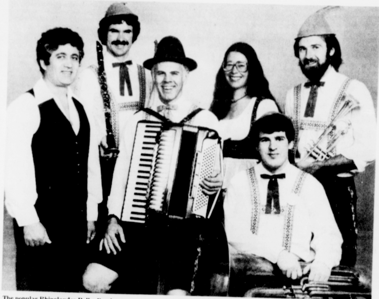
The popular Rhineland Polka Band returns to the Sandy Mountain Festival again this year. The group will fill Meinig Park with oompahs and fun from 11 a.m. to 12:30 p.m. Saturday, July 11, as they kick off the musical offerings during the two-day arts and crafts fair.