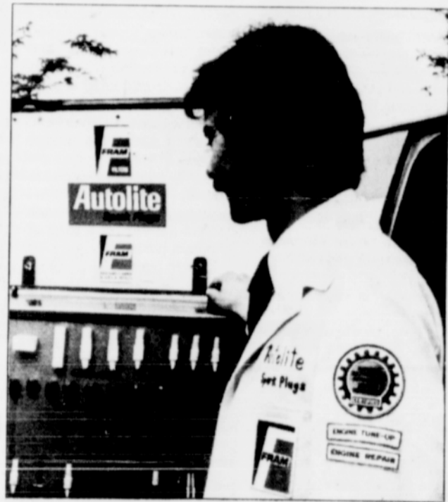
This man's patch assures you a competent mechanic is working on your car.