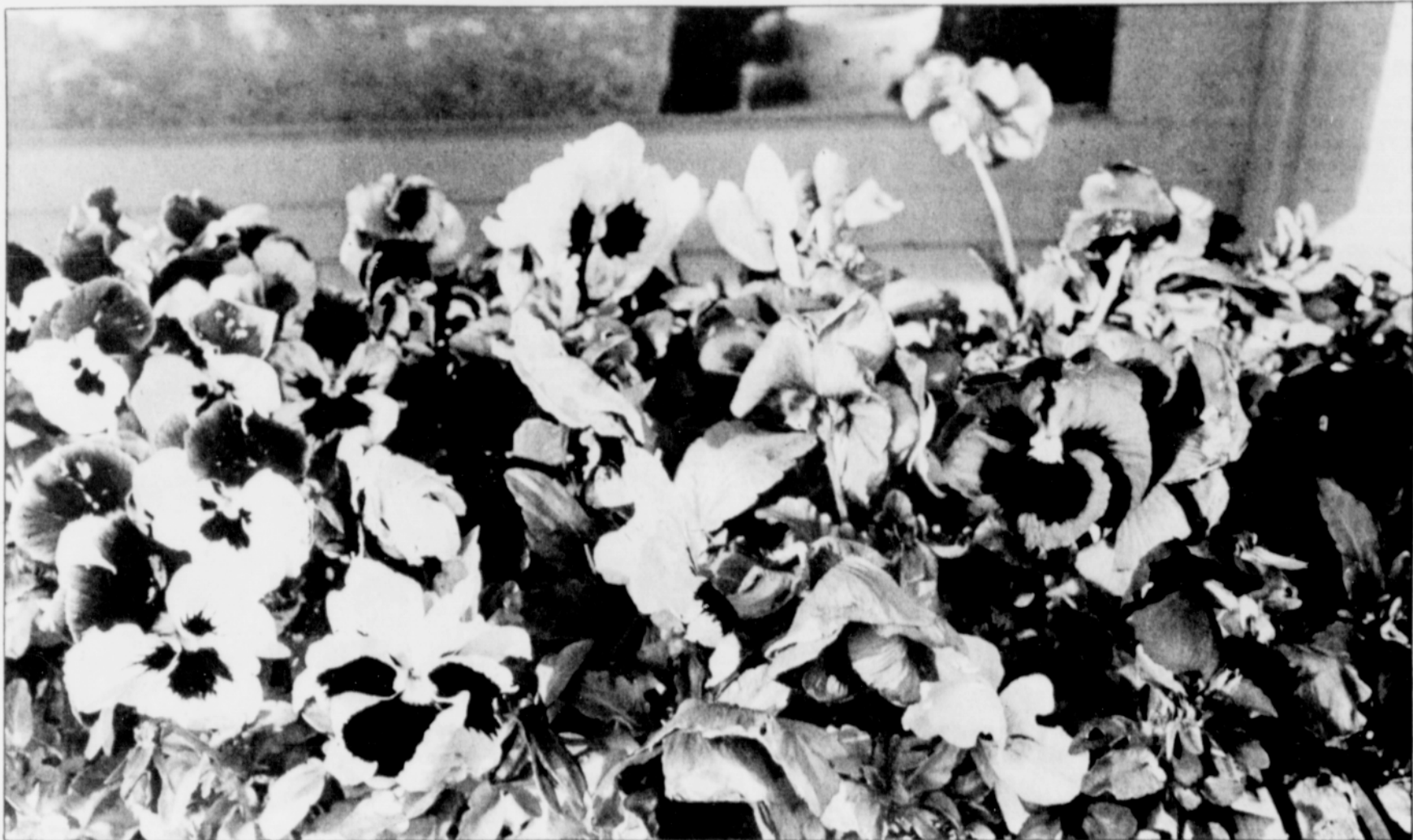
The recent sunshine brought a fresh bundle of flowers out to tempt local buyers. These pansies were on display at Janz Berryland in Sandy.