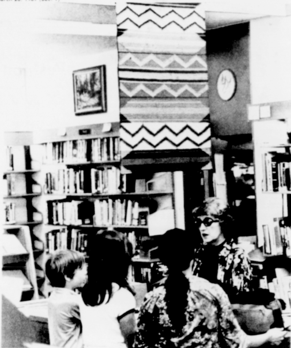
Handcrafted items like the rug hanging above the reception desk are on display at the Sandy Public Library as it prepares for the annual Silver Tea next Thursday from 2 to 5 p.m.

Interment was in Firhill Cemetery in Sandy.