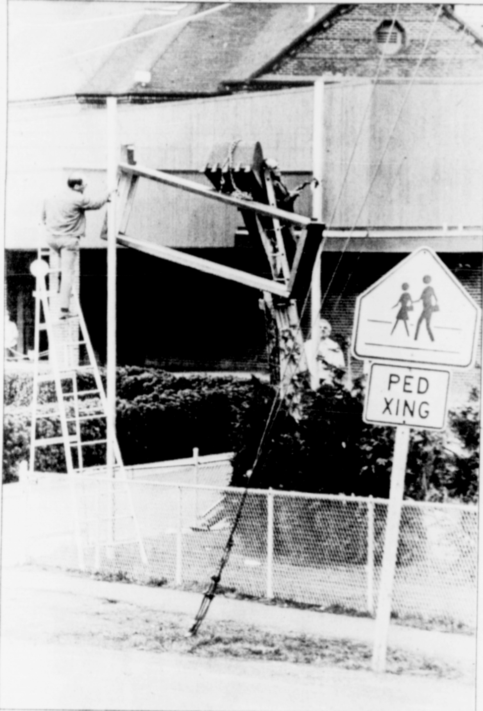
Workmen at Sandy High School re-install the school's marquee after Tuesday afternoon after it was removed for some touch-up repairs.