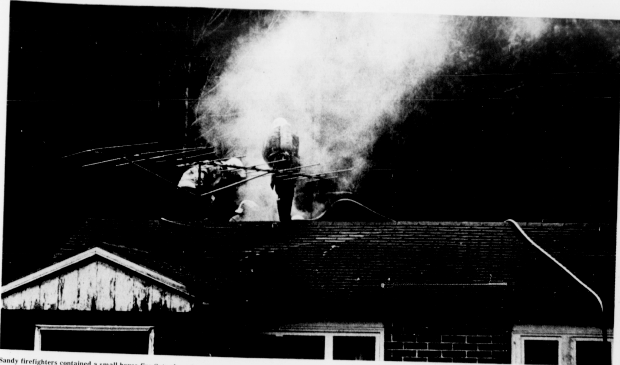
Sandy firefighters contained a small house fire Saturday afternoon at 19031 S.E. Langensand Road. The fire occurred when wooden studs abutting the chimney caught fire. Firefighters were forced to cut a hole in the roof to contain the flames.

Classifieds? Hotline phone number is 667-6633