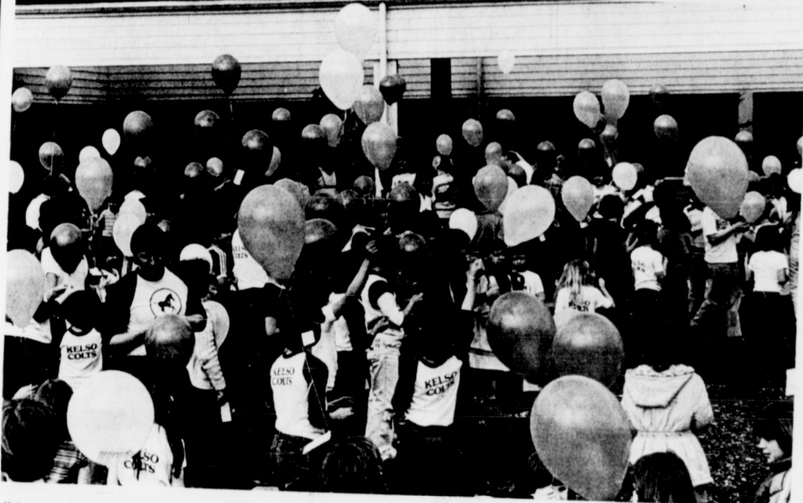
Kelso students gathered for the mass release of balloons, above, and as they drifted up, students followed theirs as far as possible.