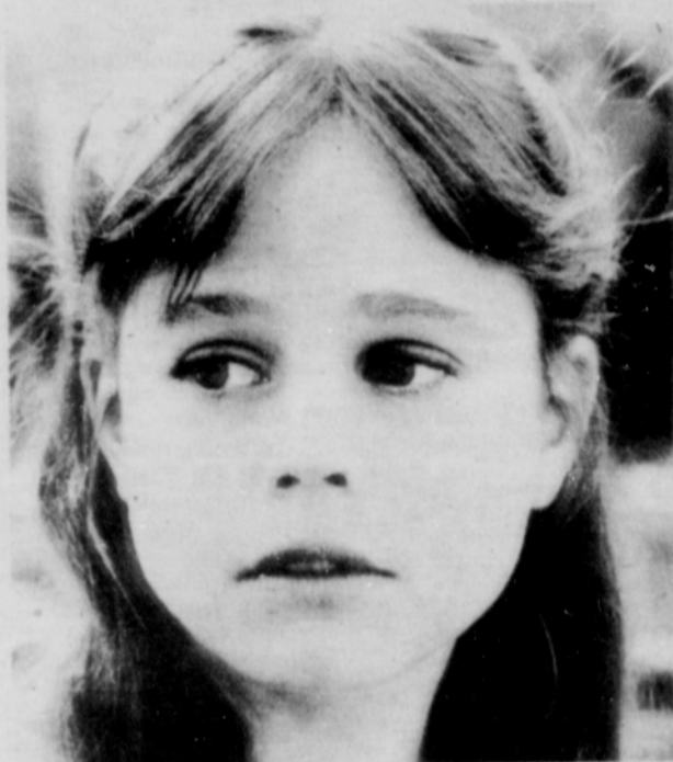
A young girl (Dana Hill) is induced into the world of child pornography in "Fallen Angel," on "The CBS Wednesday Night Movies," airing Wednesday, Feb. 18.

(Stations reserve the right to make last-minute changes.)