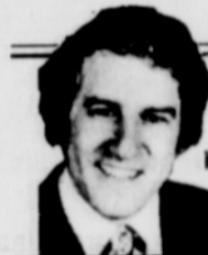
by Louis Rukeyser

At the root of Sharon's approach is a belief that the primary forces propelling gold prices are political rather than economic or financial, and that these forces — while neither "predictable nor quantifiable" — can be expected, over