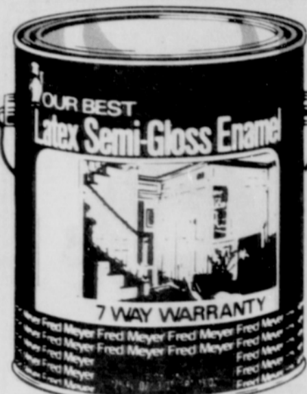
Fred Meyer 'Best' Latex Semi-Gloss Enamel Paint