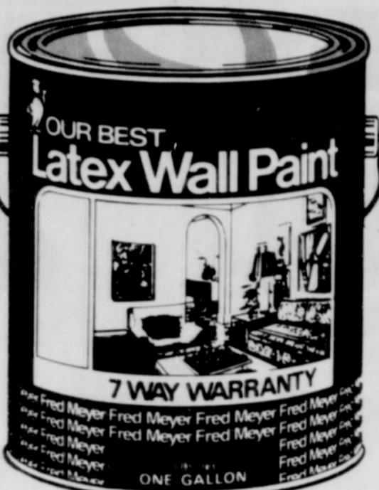
Fred Meyer 'Best' Interior Latex Wall Paint