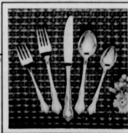
"Breton Rose" Pattern

In the Oregon Tradition of Neighbor Helping Neighbor