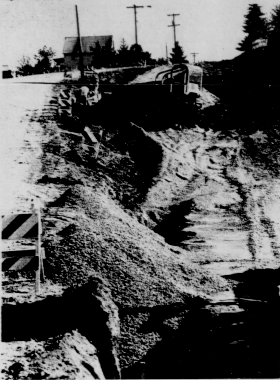
Work is underway to straighten South Bluff Road. Monday night the city council OK'd a plan to put a base under the asphalt from Nettie Connett to Sandy Heights Street. The country road had no such base placed when it was made. It will cost an additional $5,000.