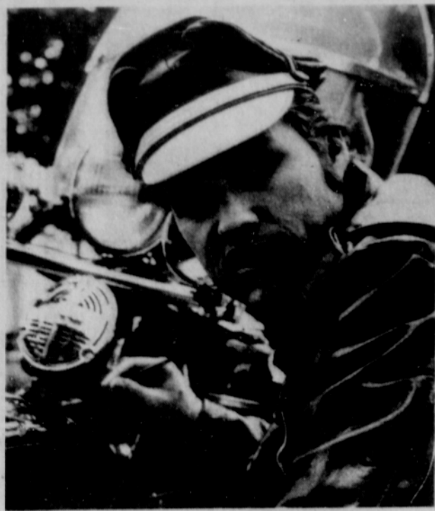
The "funny-looking kid" singing "funny-sounding rockabilly songs" is soon taken very seriously and hailed as "The King" when Kurt Russell stars as Elvis Presley in ELVIS , an affectionate biography of the American hero, which will have a special encore showing on ABC-TV's "The ABC Monday Night Movie," Feb. 25.

infantry members known as the "Men of Bronze", who fought on the front lines during World War I and were the most decorated American regiment in the war. (60 mins.) 12 NEWS 11:00 2 6 NEWS 10 DICK CAVETT SHOW 12 BENNY HILL 11:30 2 BARNEY MILLER "Massage Parlor" Detective Janice Wentworth arrests a cowboy at a massage parlor. (Repeat) 6 PRISONER: CELL BLOCK H 6 NEWS 10 ABC CAPTIONED NEWS 12 ODD COUPLE 12:00 6 CBS LATE MOVIE "HARRY O: Shades" A black housekeeper is charged with murder and the woman's employer hires Harry to clear her. (Repeat) MCCLLOUD: Bonnie And McCloud Stars: Dennis Weaver, Leigh Taylor-Young. (Repeat) 8 THE TONIGHT SHOW Guest host: David Letterman. Guests: Hoyt Axton, John Ritter, Irving Wallace. (90 mins.) 12 MISSION IMPOSSIBLE 12:05 2 POLICE STORY "Squeeze Play" A compulsive gambler helps Joe Forrester trap robbers who hold up big poker games. (Repeat) 1:00 12 NEWS 1:15 2 MEDICAL CENTER 1:30 8 TOMORROW 2:05 6 MOVIE -(COMEDY)-