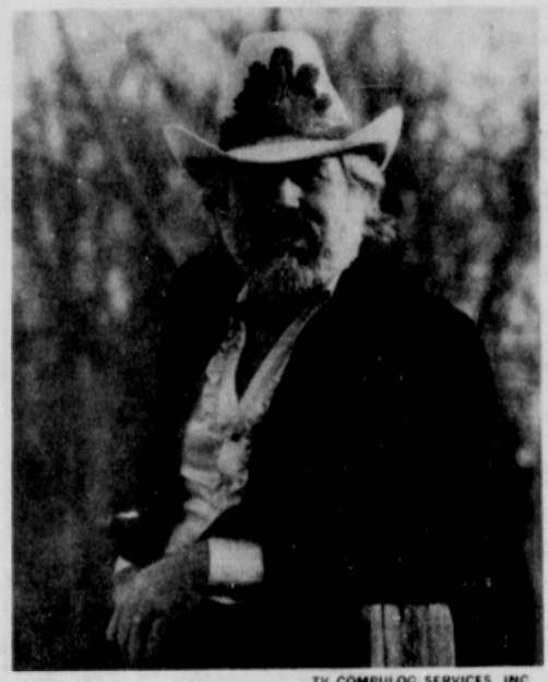
TV COMPULOG SERVICES, INC.

12:30 6 CBS LATE MOVIE "BARNEY JONES: The Lonely Victims" A con artist chooses as his victims women who hold responsible jobs in companies ripe for robbery. (Repeat) "RITUALS" 1978 Hal Holbrook, Ken James. 12 NEWS 1:00 8 TOMORROW 2 NEWS 2:15 8 NEWS 2:30 3:00 6 MOVIE -(MUSICAL-COMEDY) ** "Lucky Me" 1954 Doris Day, Robert Cummings. An unemployed chorus girl in Florida finds love instead of work. (2 hrs.)