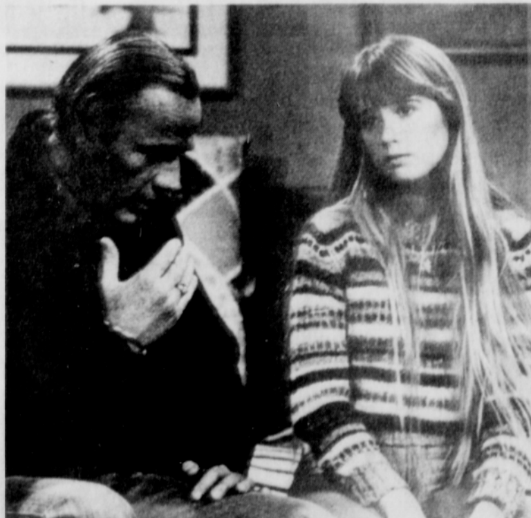
Larry (McLean Stevenson) tries to soothe a depressed Ruthie (Kim Richards) after the death of her grouchy old piano teacher following a high-pitched lesson, in "The Neighbor Dies," on NBC-TV's HELLO, LARRY, Wednesday, Feb. 27.

When Barettá sets up a crime leader for an arrest, he fears that various gangland factions will now battle for control of the leaderless vice activities. (Repeat, 2 hrs., 15 mins.) 6 PRISONER: CELL BLOCK H 8 THE TONIGHT SHOW Host: Johnny Carson. Guest: Jim Stafford. (90 mins.) 10 ABC CAPTIONED NEWS 12 ODD COUPLE 12:00 6 CBS LATE MOVIE "MARY HARTMAN, MARY HARTMAN" Charlie beams as Loretta cuts the record of her dreams. (Repeat) "STRANGER IN OUR HOUSE" 1978 Stars: Linda Blair, Lee Purcell. 12 MISSION IMPOSSIBLE 1:00 8 TOMORROW 12 NEWS 1:45 2 NEWS 2:00 8 NEWS 3:00 6 MOVIE -(BIOGRAPHICAL) *** "Story Of Will Rogers" 1952 Will Rogers Jr., Jane Wyman. The story of the great rodeo star, humorist, writer, and film comedian. (2 hrs.)