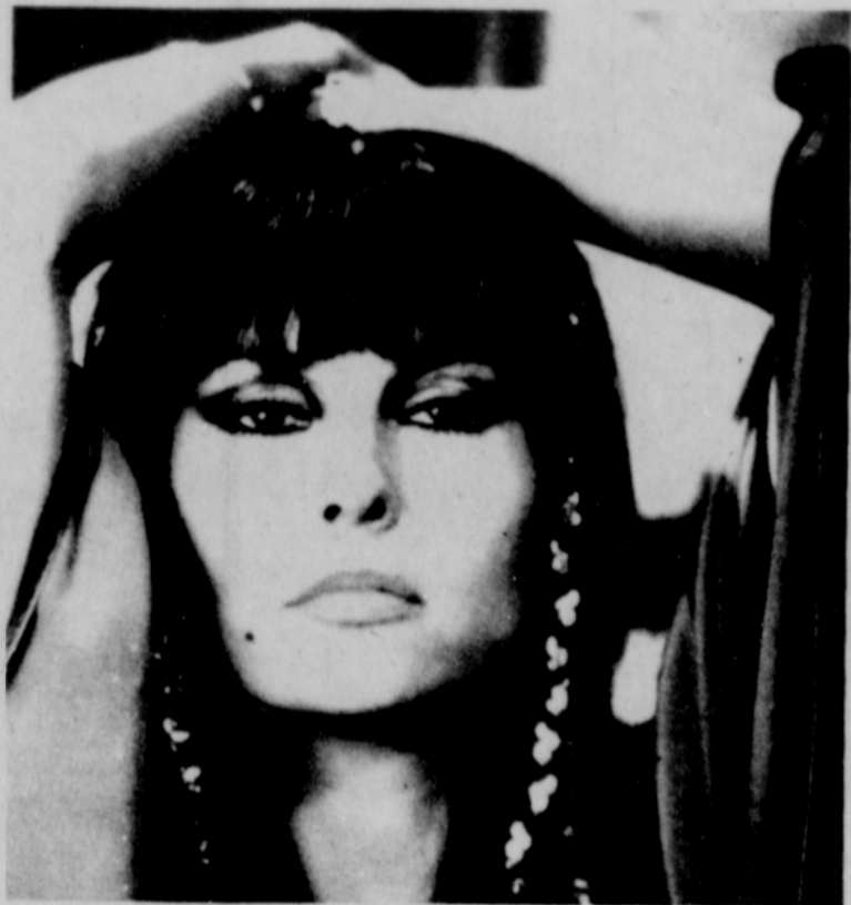
Cornelia Sharpe portrays female super-spy Lavinia Kean, and Omar Sharif plays the romantic villain she encounters, in S.H.E. , an action-adventure drama on 'The CBS Saturday Night Movies,' Feb. 23.