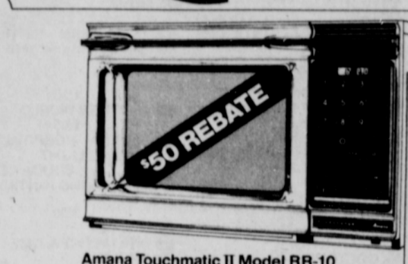
Amana Touchmatic II Model RR-10... The Next Generation of Microwave Ovens.