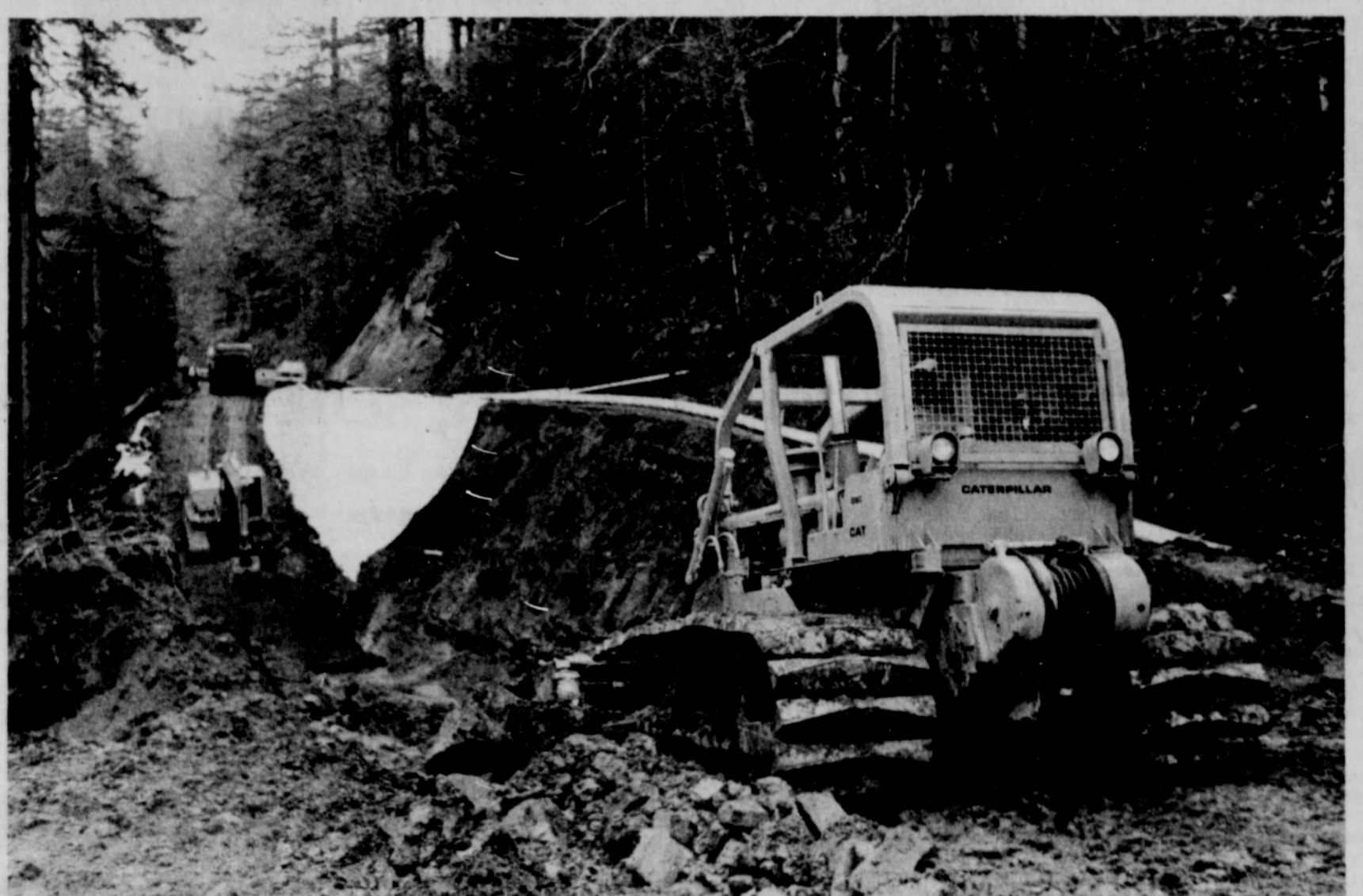
County crews have begun work on the washout that has blocked Ten Eyck Road since Jan. 14. Crews are now laying down a track so heavy equipment can clear debris at the bottom of the ravine and begin work on a culvert that

"Since the county franchise only applies to the area outside the city, we'll probably go to the city council for permission to go inside the city," Gorman said. "This is a natural area for cable, we feel, and the phone company, which already has the lines and some of the equipment that a cable TV system needs, would be ideal to handle it."