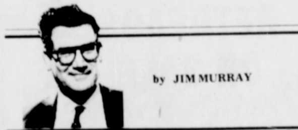
by JIM MURRAY

The modern ballplayer complains about the ar-