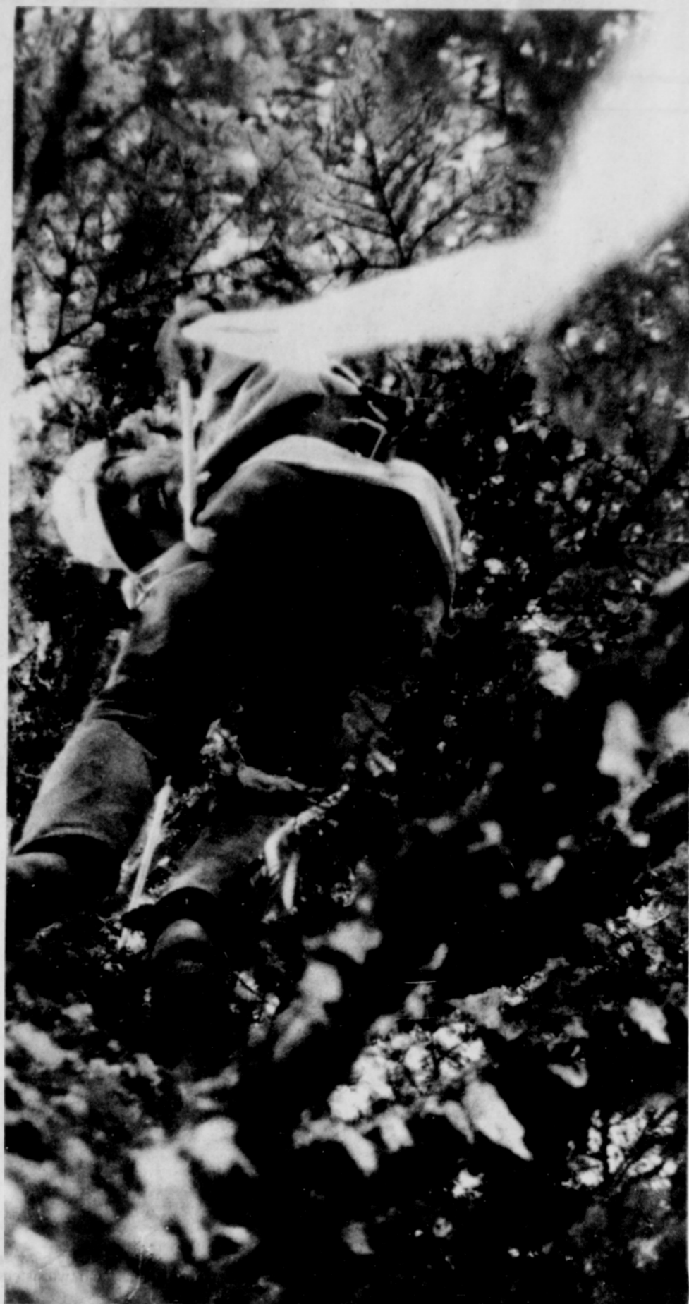
Rappelling is a fast way down, if there are no limbs.