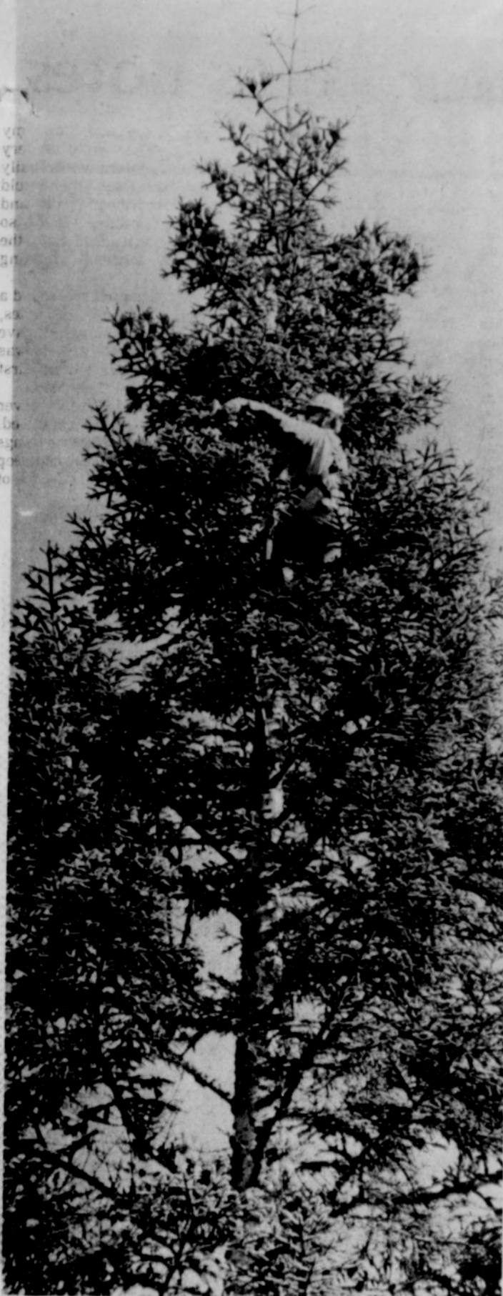
Dave Hanken picks at the 100-foot level.

So the next time you see a guy in a forest service outfit at the top of a 100-foot Noble Fir don't be alarmed, he's just your average conehead.