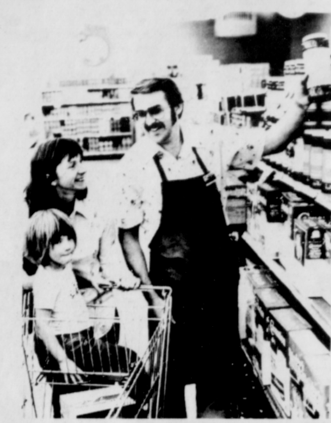
Even the boss takes time to help.

12-OZ. PKG. - ALL MEAT OR ALL BEEF HYGRADE WIENERS ..... 89¢ PER 12-OZ. PKG. - REG. OR HOT - NORWEST TURKEY SAUSAGE ..... 89¢ PER 2-LB. PKG. - EXTRA THICK BAR-S SLICED BACON ..... $2.69 12-OUNCE PACKAGE ARMOUR SMOOKES ..... $1.39 YOU'LL LOVE OUR OREGON SHRIMP ..... $3.59 FRESH BLACK COD FILLETS ..... $1.39