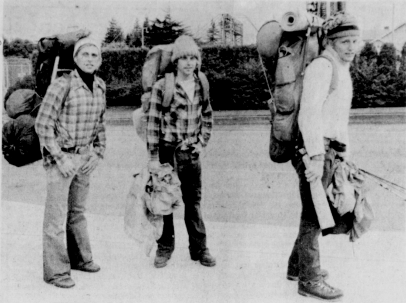
Just a few miles to go