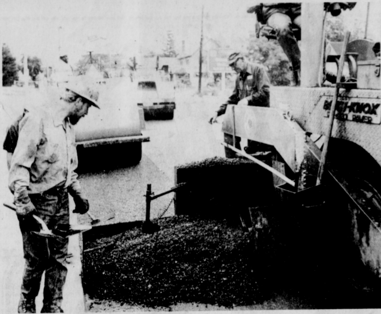
POURIN' IT ON! Paving of U.S. Highway 26 is finally reaching its completion as the construction crew begins pouring asphalt on the streets of Sandy. Crew members are checking to make sure the mix is poured close enough to the curb to satisfy the state highway inspector.