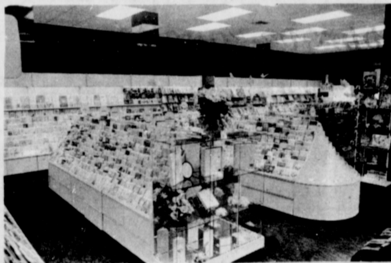
SANDI'S Hallmark SHOP

Gordon Stone's specializes in quality mens clothing and shoes. You will find the best name brands in mens clothing today at Gordon Stone's. Gordon Stone's has built their reputation not only with quality clothing, but also with "old fashioned" service. Our sales staff are very product knowledgeable which will aid in helping you make the right selections.