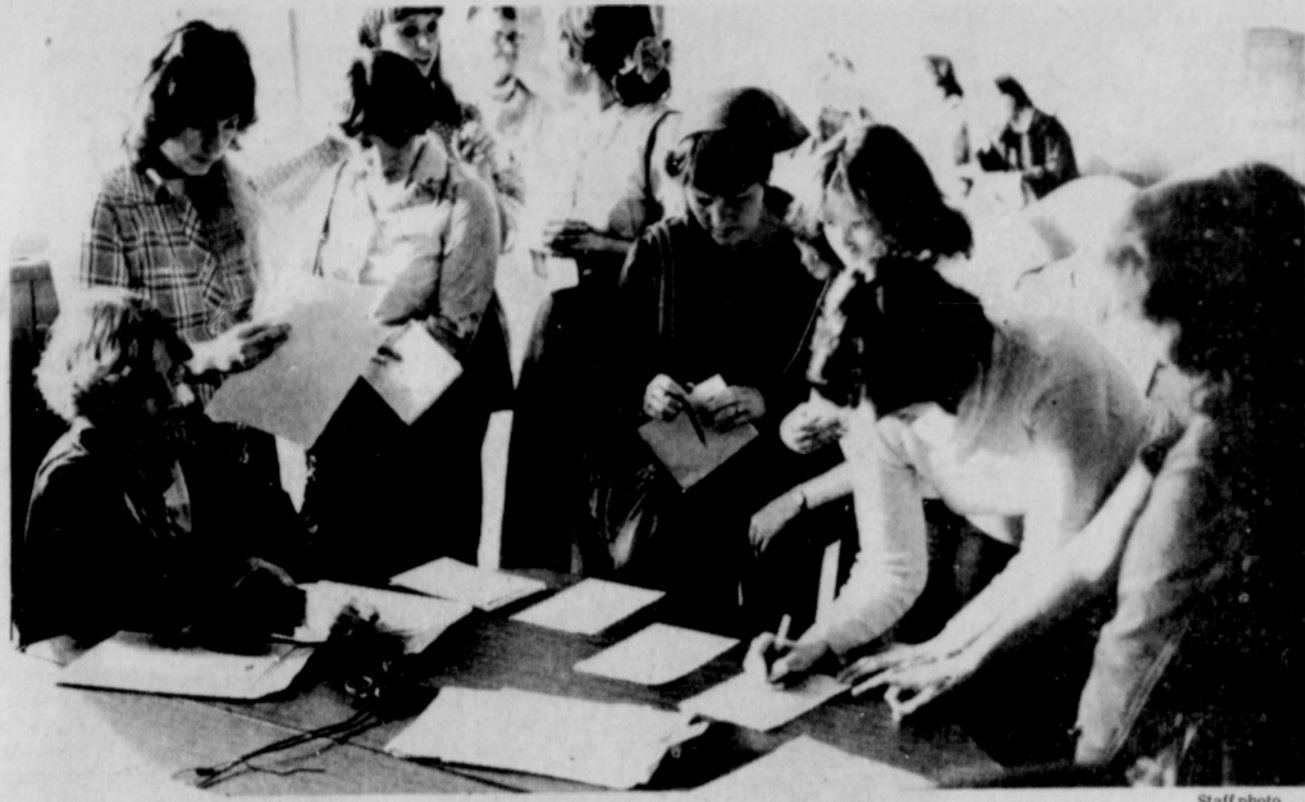
SANDY AND GRESHAM area women pick up petitions for a weekend drive to gain signatures to end state-funded abortions.