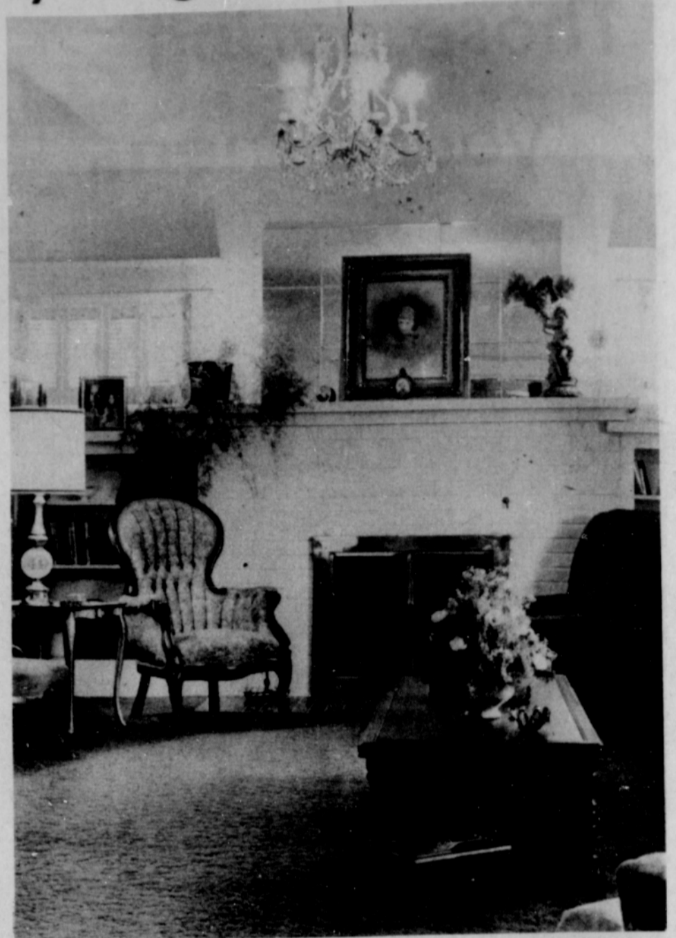
ELEGANT DINING room of the Rowell home.

Entry way at the front door features a grandfather clock and soft blues for a mellowing effect.