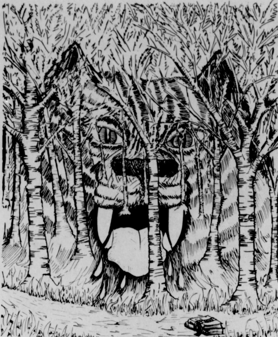
A little shortcut through the woods

We suggest they go clear outside where their fumes won't bother anyone. Except perhaps each other.