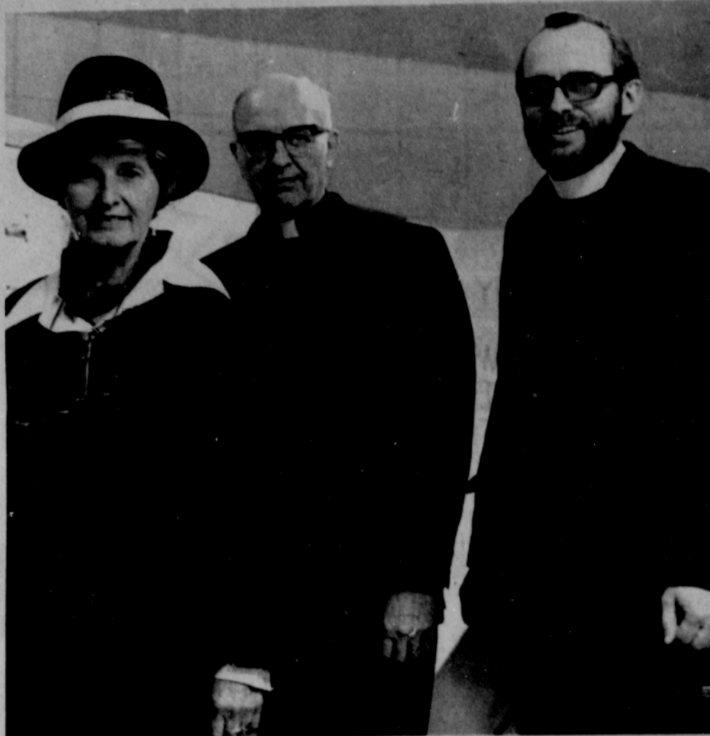
Lutherans celebrate anniversary