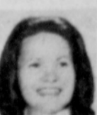
Ask for Judy Kay

MINI-ORCHARD THIS NICE family home has 3 good sized bedrooms, family room off kitchen, formal dining room, fireplace, storm windows, single garage w-electric door opener. Large back yard w-many fruit trees and garden space. $29,500. Call 255-2005.