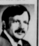
Ask for Richard Clapp

CENTENNIAL HI '16,950 WELL MAINTAINED, cozy bungalow style on 70 x 117 ft. lot. Convenient to shopping, one block to bus line. Two bedrooms, kitchen w-eating area, stove and drapes included. Call 666-4594.