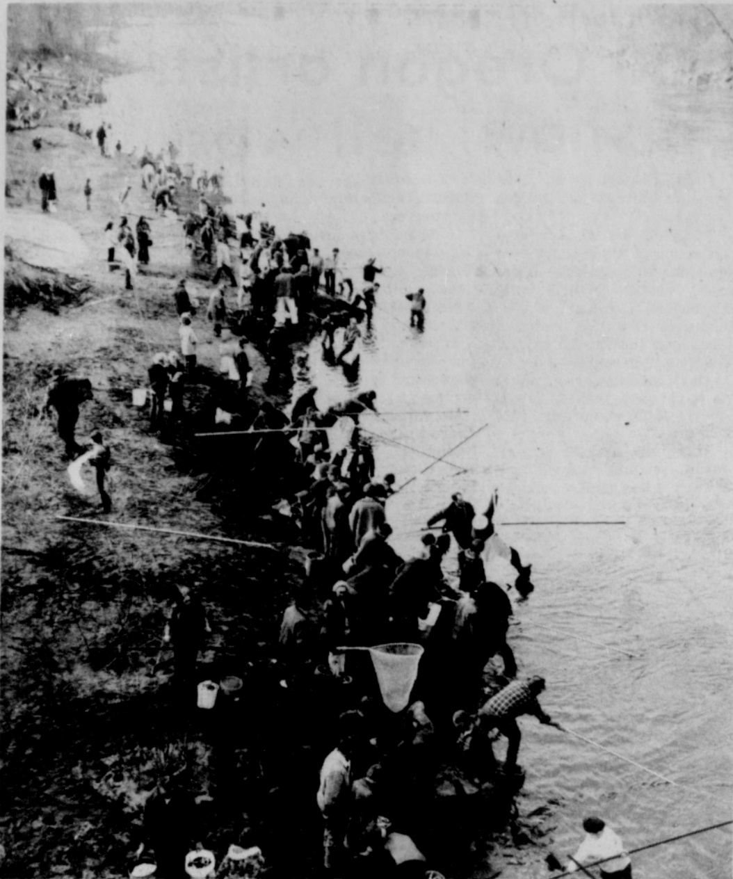
STANDING ROOM only at the water's edge is the general rule for smelt dippers. Later in the run most came out better equipped with waders, rainwear and an occasional boat. Observers said Saturday's crowd was the largest.

This was the last AAU meet for the winter season. The summer swimming season will start May 1.