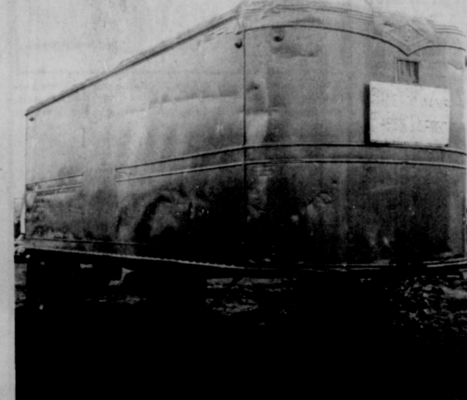
WAITING FOR PAPER... This Kiwanis Paper Truck located near the Sandy Oddfellows Hall off Proctor is open 24 hours a day for local residents to deposit

The 6-5 senior has averaged 20.7 points a game for Sandy High School this past season.