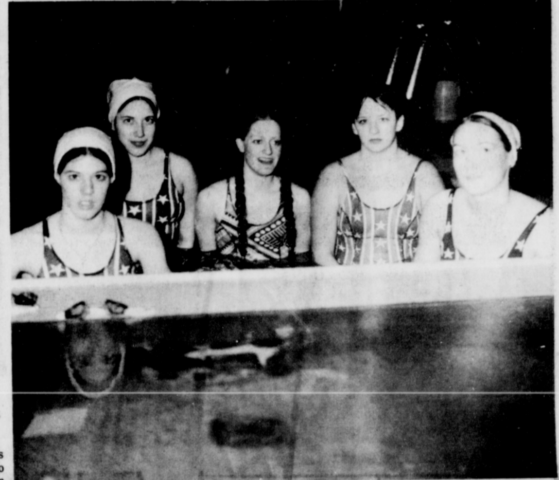
AFTER HELPING their team place second at last weekend's district meet, these top-rated girl swimmers will be representing Sandy High School this