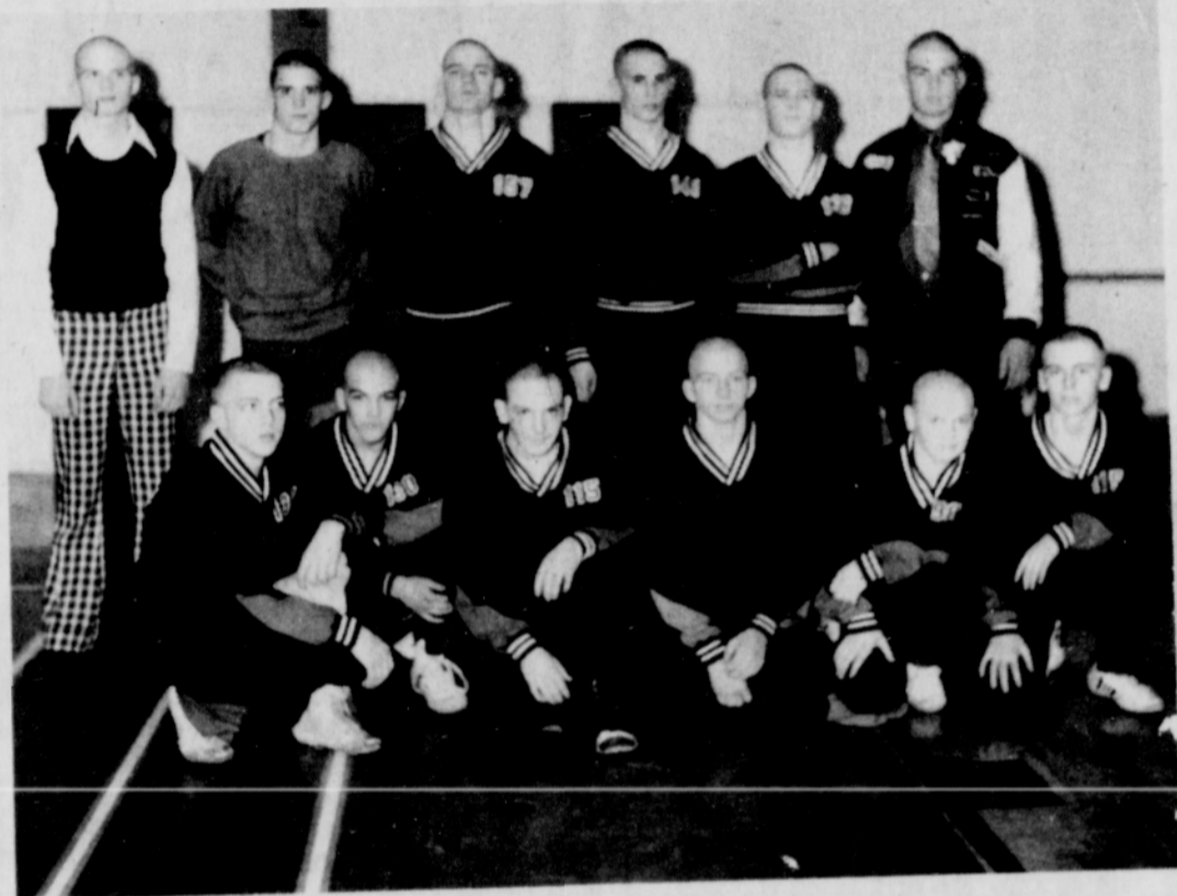
HEAD LICE in the wrestling mats? No, just a unique preparation twelve Sandy High School wrestlers took last week