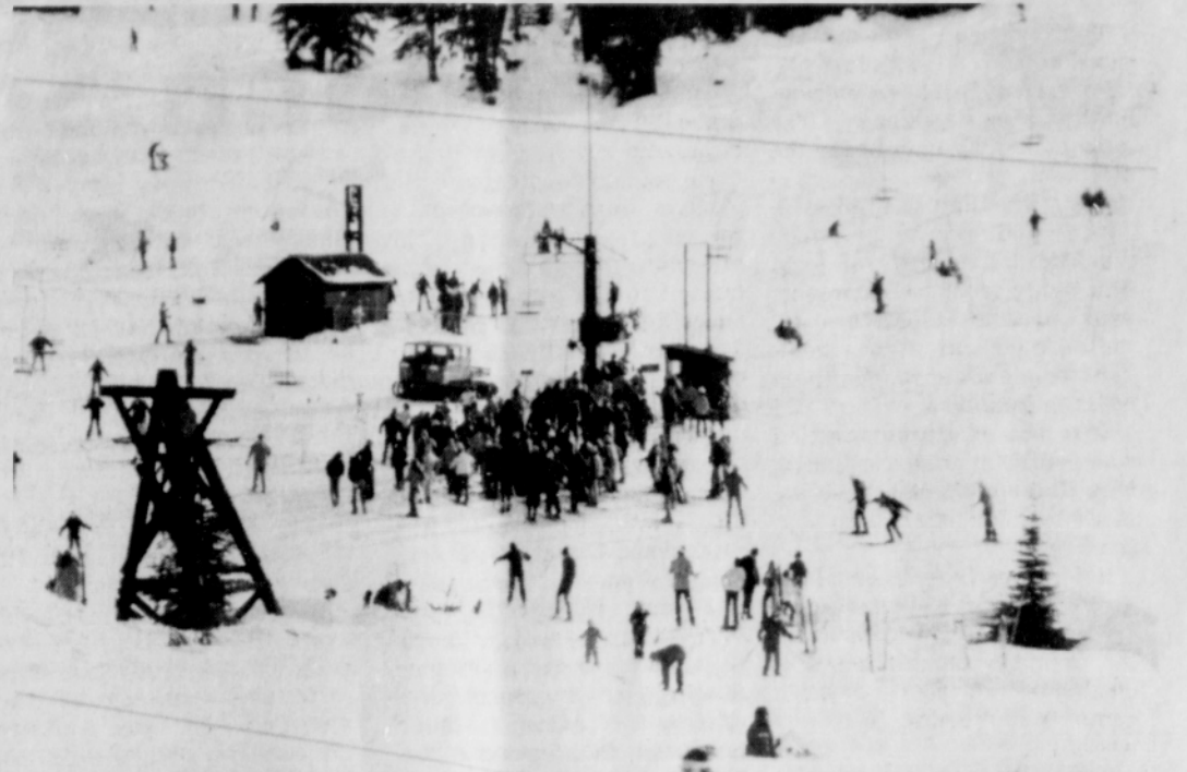
MANY SKIERS are crowding the slopes on Mt. Hood as an early snow fall has given local skiers a chance to get in some good early season runs. The ski season is being threatened by the fuel shortage throughout this area and the country. Local ski area managers are working to conserve energy and also to protect the right of skiers to

It was indicated the skiers should write their Congressmen and the office of Petroleum Allocation.