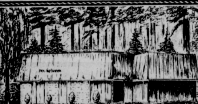
The Inn Between Steak House Hwy 26, Wemme, Ore.

Live Music - Great Sandwiches Cook your own Steak