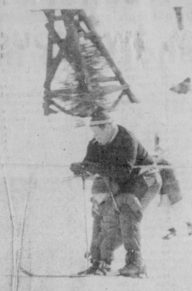
THIS YOUNG skier gets some help on learning to ride the rope tow at Ski Bowl ski area on Mt. Hood.