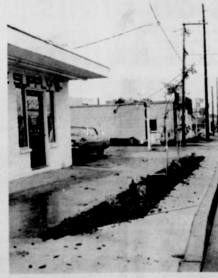
STORES ALONG Proctor Ave. have been working to get plantings in this past week. Here shrubs have been planted in front of the Sandy Office Supply and Abbey Print Shop building.