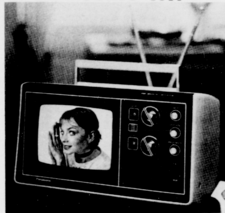
CT-772 The Wildwood All Solid State Color Portable with 7" Diagonal Screen

WEEKLY PRIZES WILL BE AWARDED EACH WEEK SIGNUP TODAY