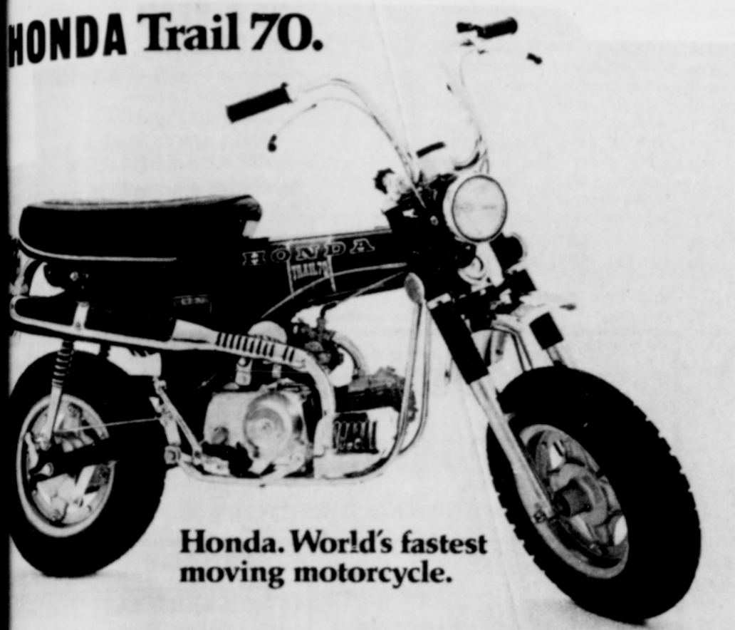
Honda. World's fastest moving motorcycle.