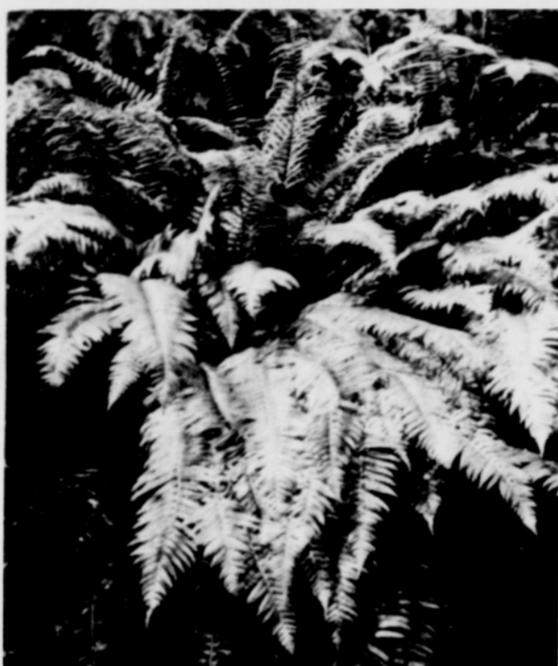
LUSH GREEN undergrowth glistens with raindrops on wash day at Wildwood.