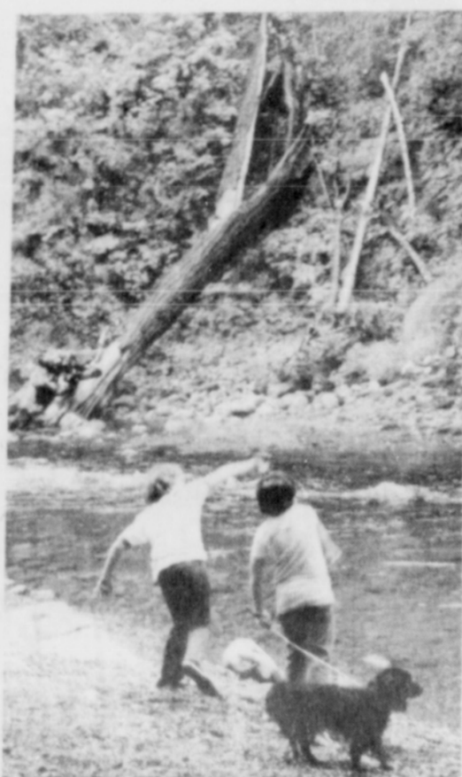
SKIPPING STONES across the river is more of challenge on cloudy day. Dog would like to chase, but leash is must at Wildwood.