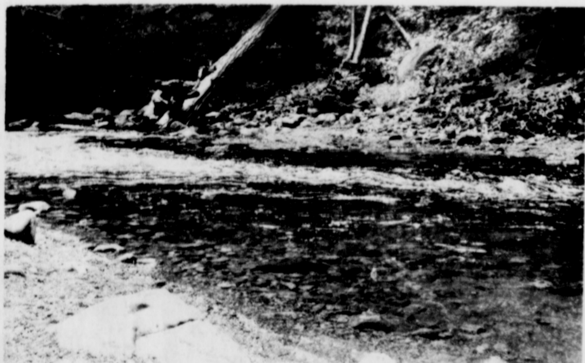
BREAK IN clouds shows boulders marching through sun-dappled stream.