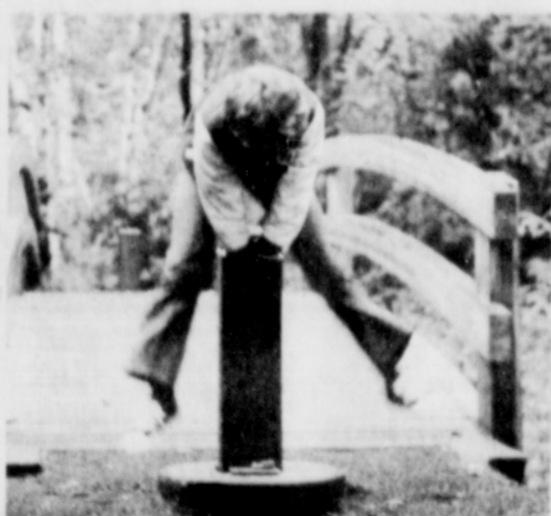
RAIN DOESN'T dampen enthusiasm of leap-frogging young visitor.