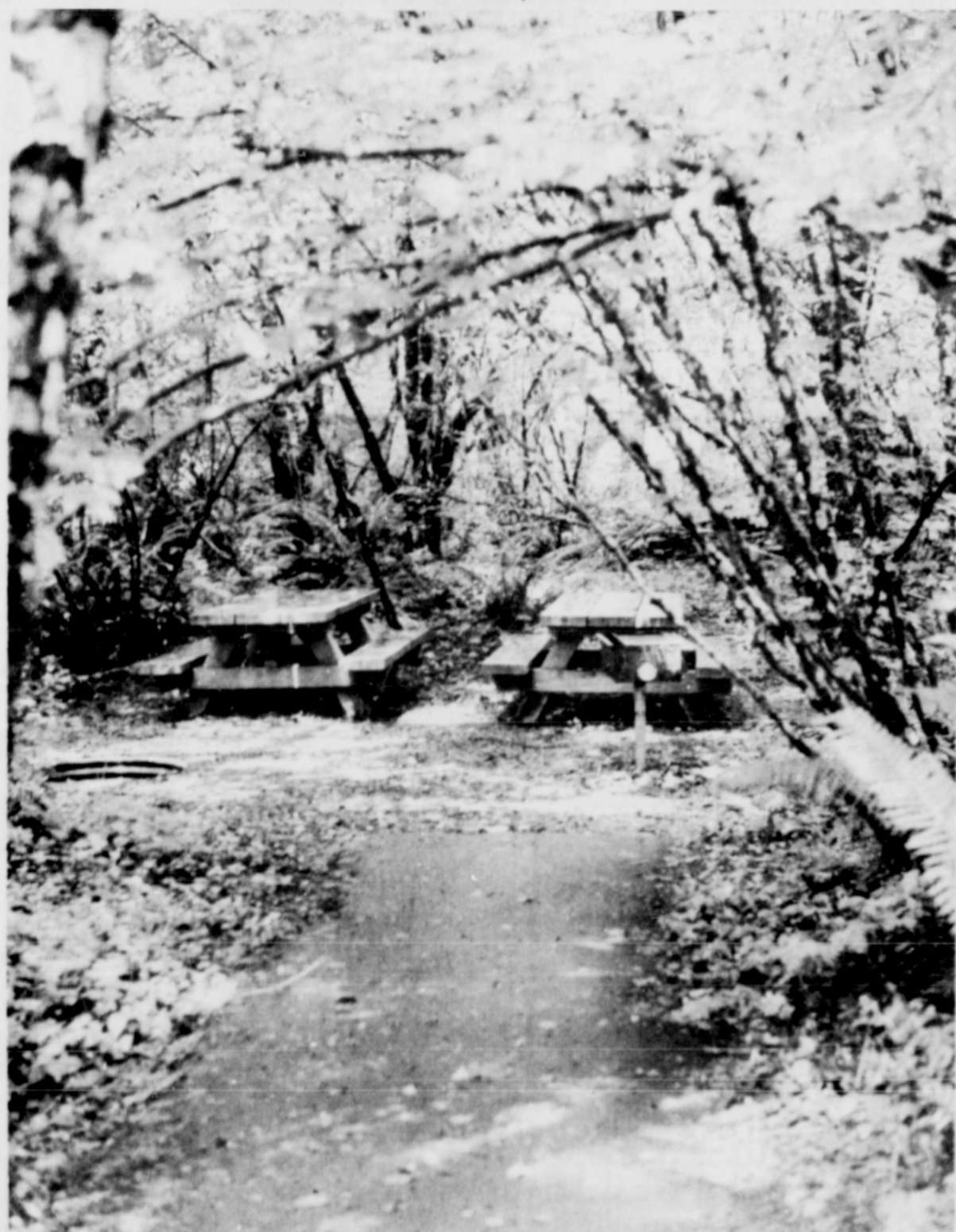
SECLUDED WITHIN a grove of trees, each picnic area has canopy of leaves to filter rain, or hot sun.