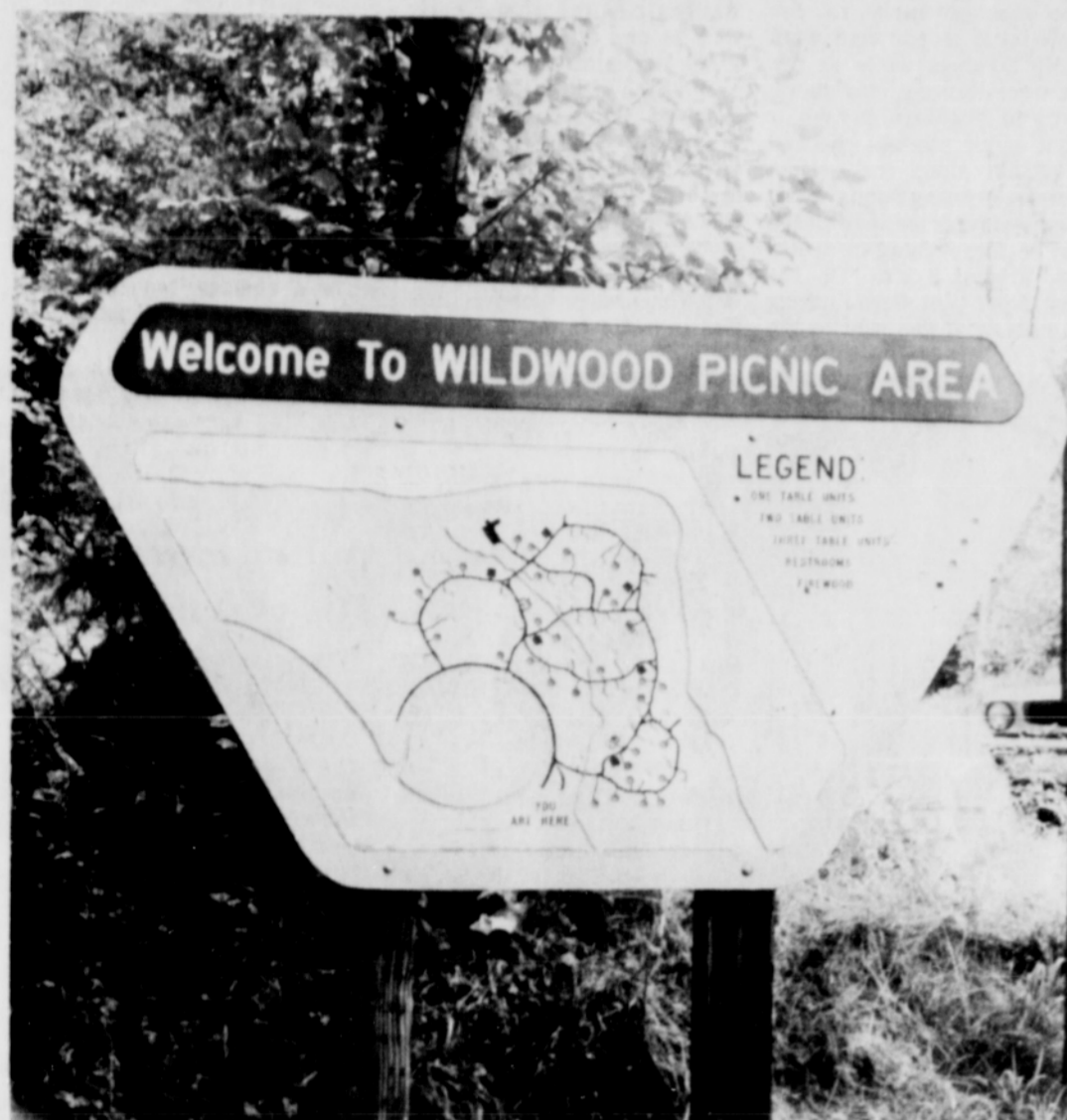
NO PICNICKER need get lost here.