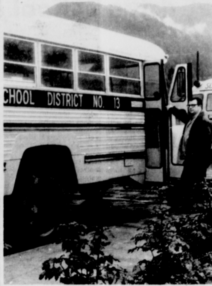
DRIVER BILL Lukens gets ready to start another run during the bad weather in Welches's 4-wheel drive bus.