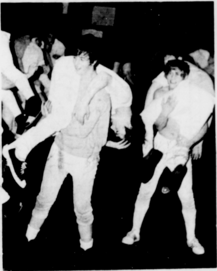
FROSH WRESTLERS at Sandy give a lift to fellow grapplers during practice. The freshmen have entered several matches this year and have produced several wins.