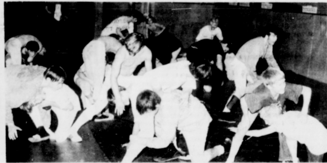
SANDY FROSH wrestlers get in some practice. The freshmen have competed in