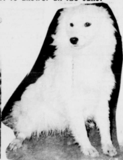
There are no Christmas trees ...