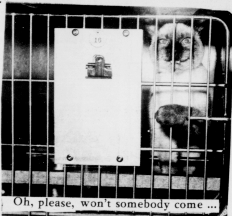
Oh, please, won't somebody come ...