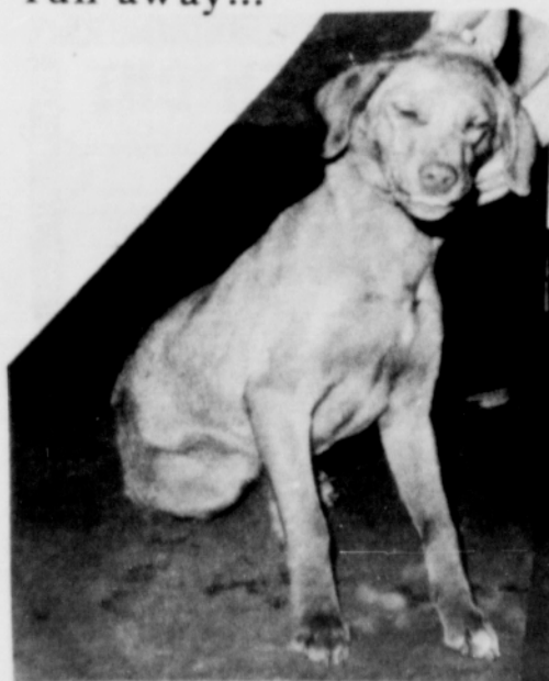
In a jail cell ...