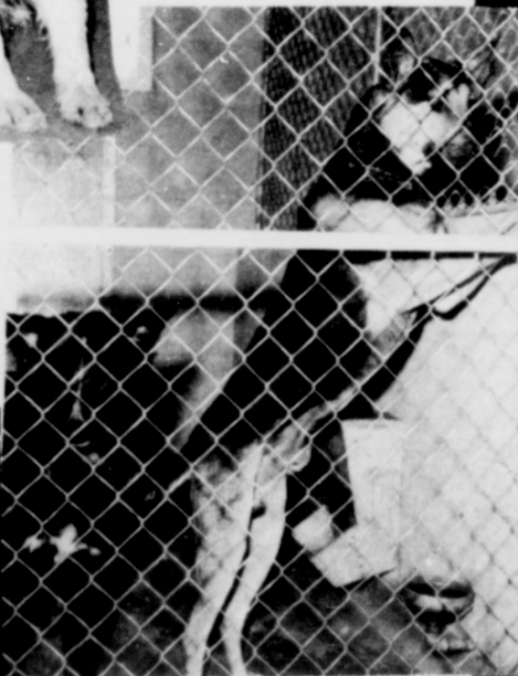
Not even if you're man's best friend ...