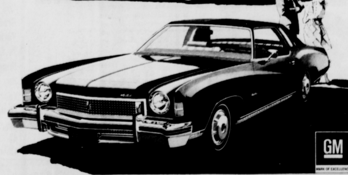
(above) Caprice Coupe. Our new uppermost Chevrolet. Its luxury, comfort and quiet ride rival the most expensive cars you can buy.