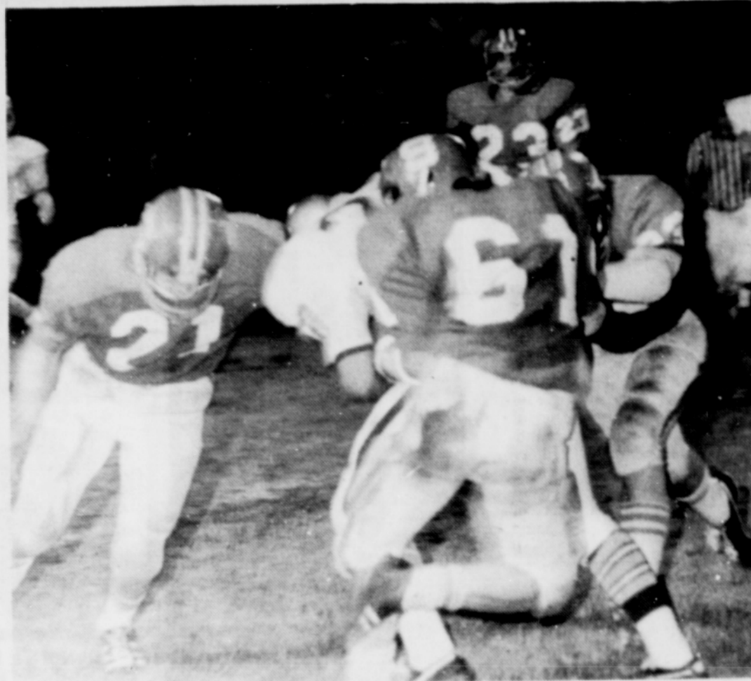
Sandy defense moves in for tackle

The next home game for the Pioneers will be on Sept. 29 against Sweet Home. Game time will be 8 p.m.