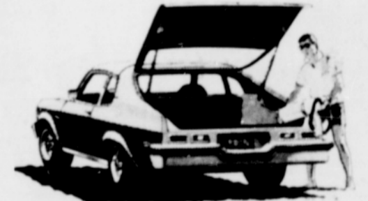
New Nova Hatchback Coupe.