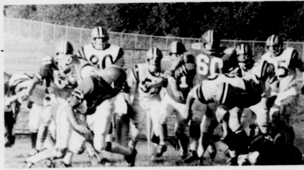
JV's stop Dallas halfback