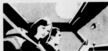
Isn't it romantic?