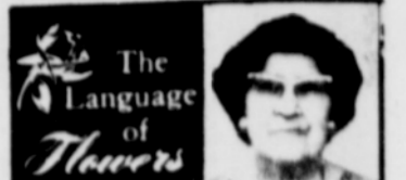
by Lytha Malcom

Latest thing at the filling station: pumps that permit you to fill your own tank, as mechanical cashiers accept dollar bills in payment.