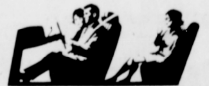
We've been thinking about your legs

You know us for our little Vega Hatchback. Now dependable Nova has one. Which literally makes it half trunk with the backseat down. It's a feature as practical as Nova itself.