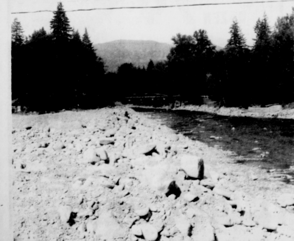
THE SALMON River recently got some work done to help the flood control problems, according to the county. The work was done by the Army Corp of

Engineers. In doing the work on the river, land above the water was added to several pieces of property and one channel of the river was covered.