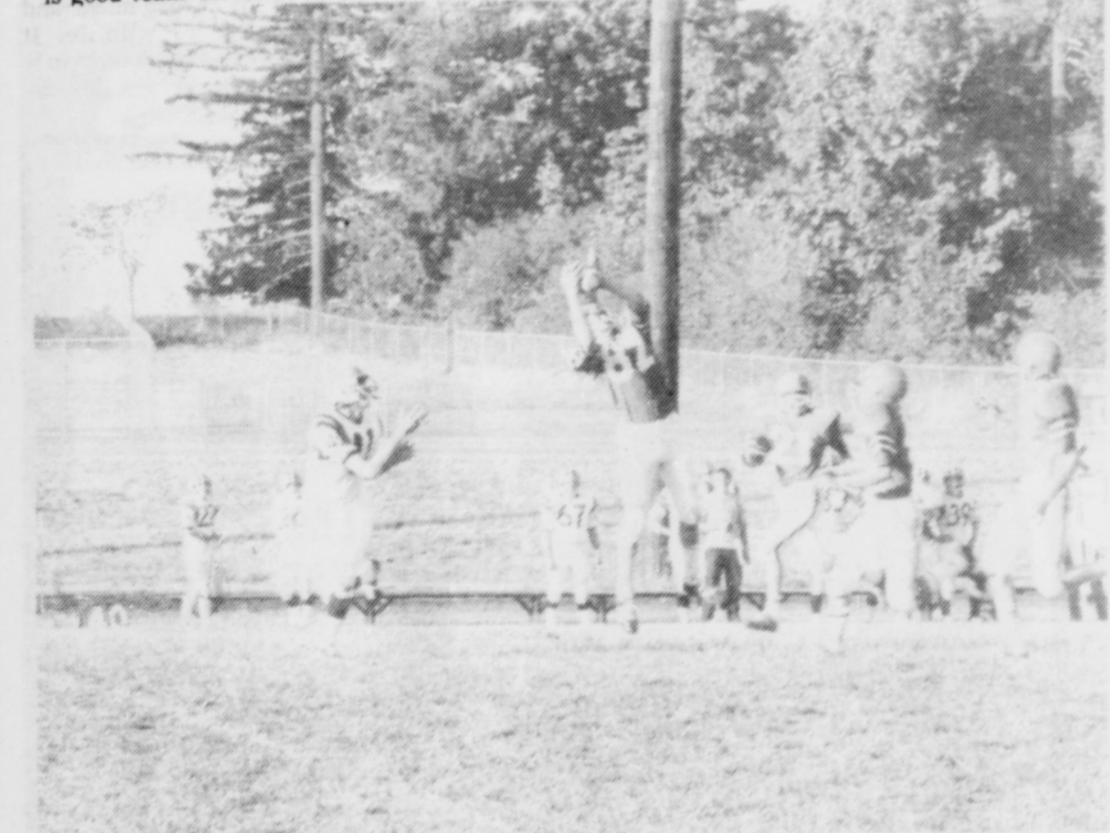
Sandy JV intercepts a pass

There are four official national languages in Switzerland: French, Italian, German and Romansch (the Swiss language).