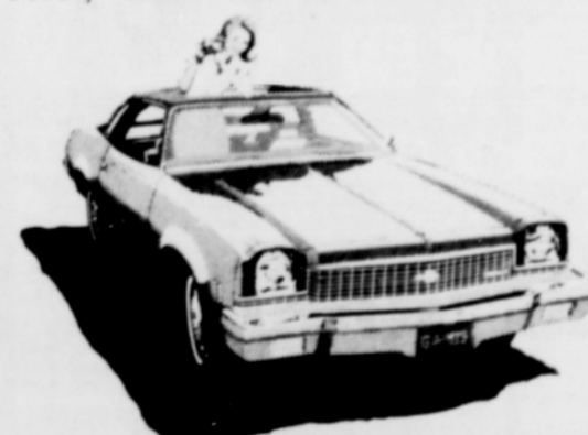
New Malibu Colonnade Hardtop Coupe.

It's standard on all big Chevrolet, Chevelle and Monte Carlo