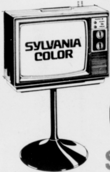
MODEL CX2176D (Base Optional)

Choosing a President is like choosing a color TV. Make a mistake and you're stuck with it. For years.