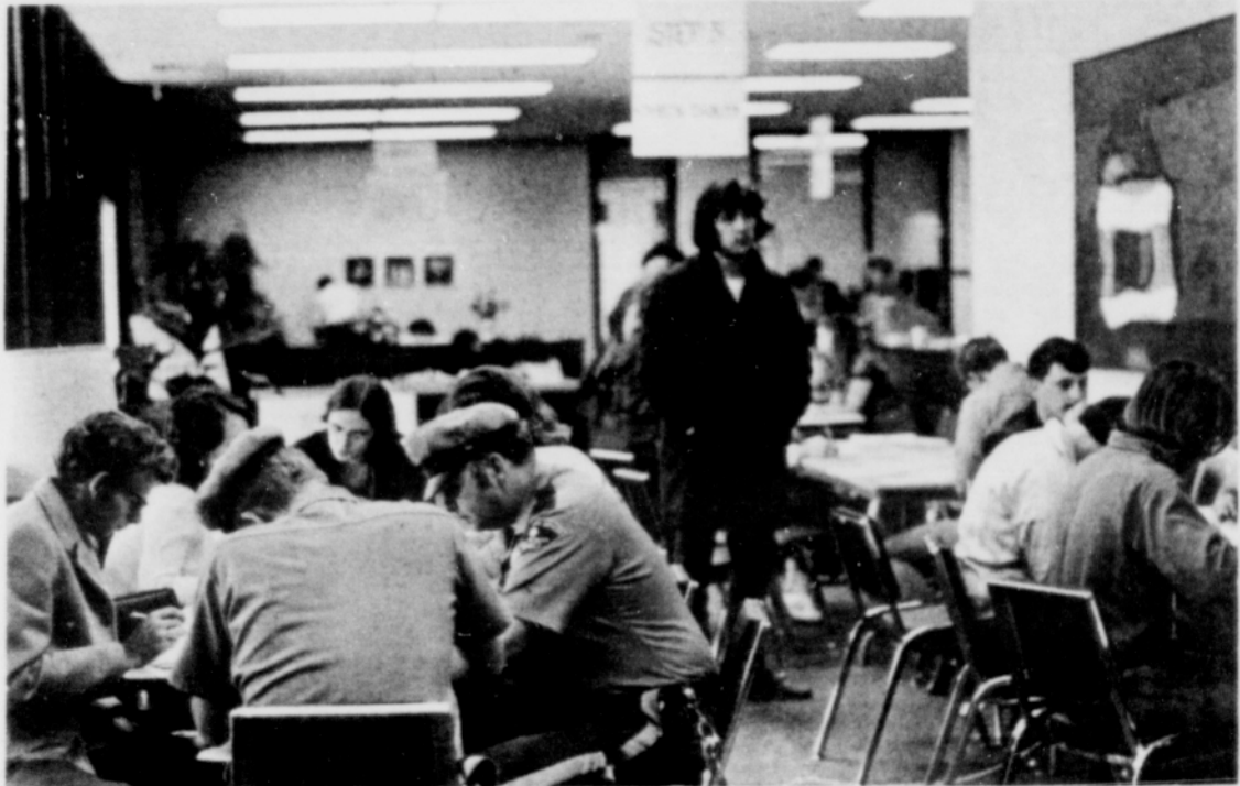
THIS IS busy time of year at MHCC as more than 11,000 students register for fall classes. About 5,500 will attend Mt. Hood full time.

There are many students whose education is going to depend on their ability to get part-time work this year.