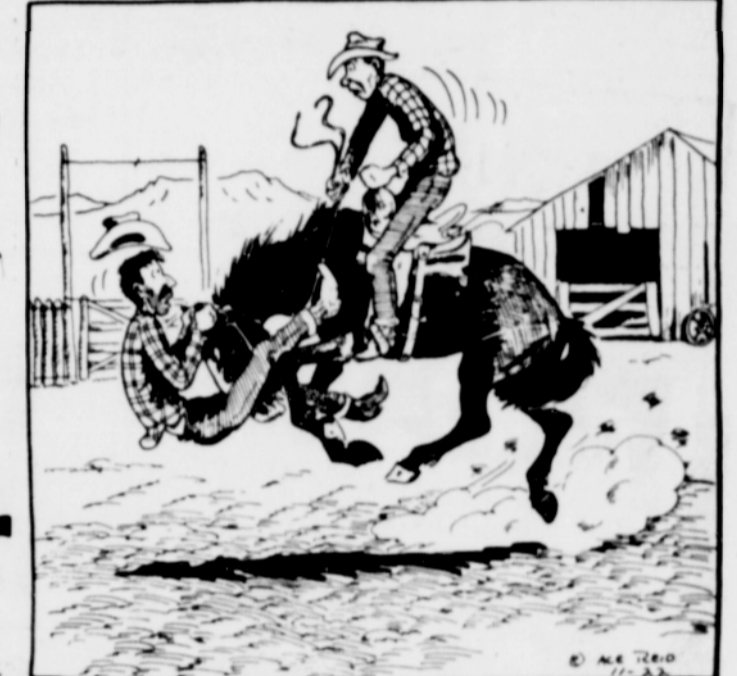
"Luke, maybe you better take a firmer grip - I'm losin' mine!"