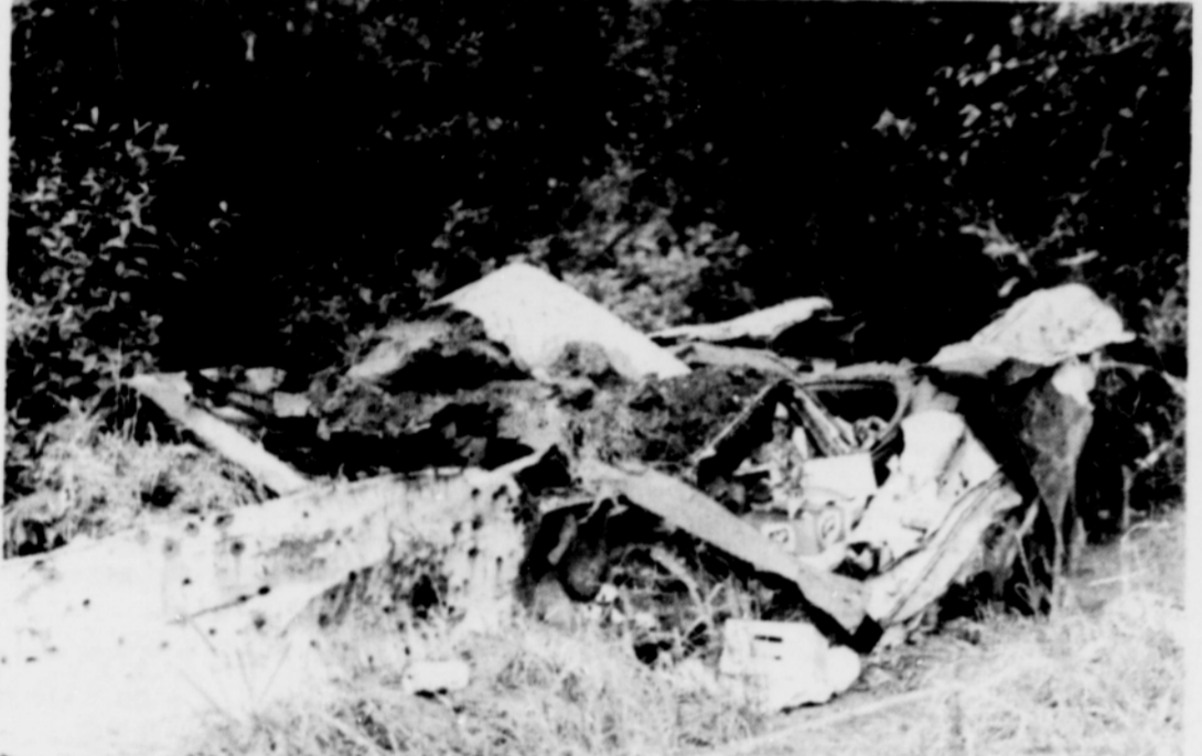
"POPULAR" DUMPING ground for trash is this old car body, located on the banks of the Sandy River across from Oxbow Park. This eyesore will disappear Saturday, when Sandy River Chapter, Northwest Steelheaders hold a cleanup drive.