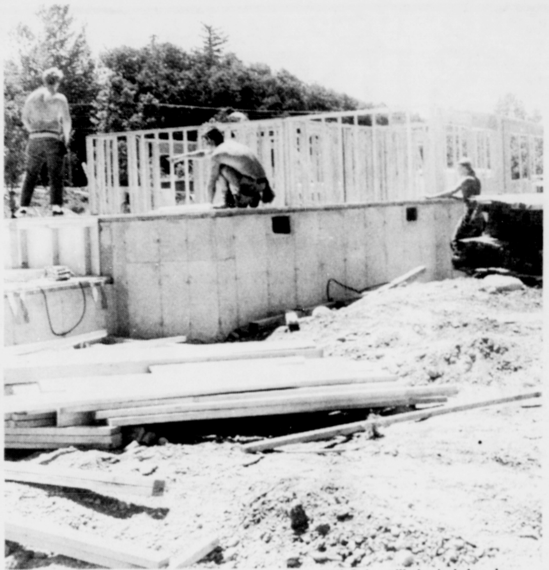
WORKERS ARE erecting the first two of 210 planned townhouses at the Tree Hill development in Wood Village. The 20 acre

site on 238th Drive will also include a day care center for children and a recreation building.