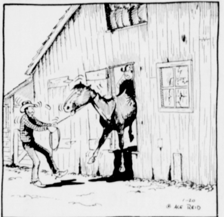
"You got in there, you dang old coyote bait, now come on out."