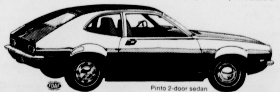
Pinto 2-door sedan *Based on a comparison of sticker prices for base 2-door models. Optional white sidewalls, plus dealer prep and destination charges, if any, title and taxes, are extra.

Your Northwest Ford Team's Pinto puts you ahead every time! Now Pinto is sticker-priced $149 less than the Toyota Corolla 1600. And there's more good news - because Pinto is also $161 less than Datsun 510, $100 less than Vega, and $199 below the VW Super Beetle 113"! Check all the Pinto differences with your own fun-test soon. At your nearby Ford Dealers.